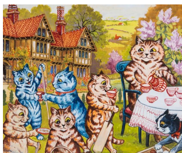
Louis Wain, A Summer Tea Party.

I have been working hard behind the scenes to update the membership information in our church community's Database. If you don't yet have a login please email me at office@stpaulslakewood.org , or phone 303-233-4991. Having a login will allow you to your information and the Membership Directory. I would love to help with entering your email and phone number accurately, while learning more about your skills and ministry needs. I would also love to connect with you with the right people to help improve the life of our community. This way everyone can receive all the notices, bulletins, and newsletters, and we can all engage with the community at St. Paul's. Don't delay, call today!